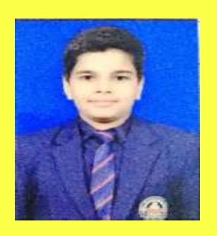
DEV LITERARY SECRETARY