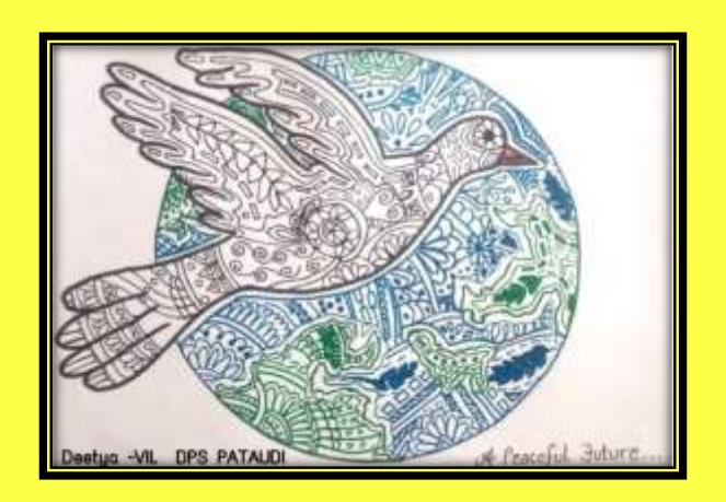
Deetya - VII