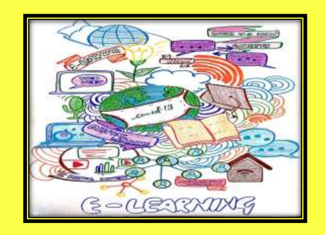
Hunar - VI