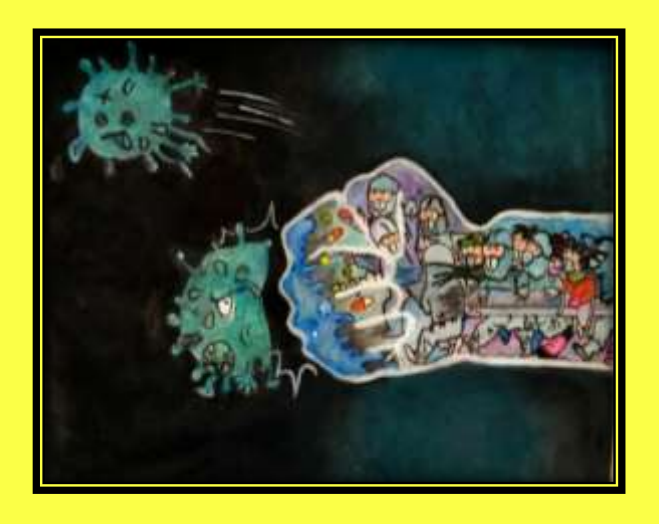
Ankita - X