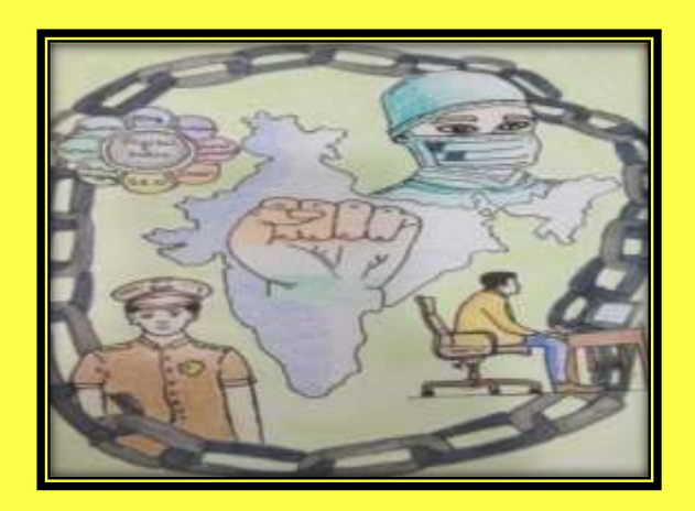
Deetya - VII