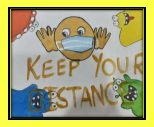
Kashish - XI